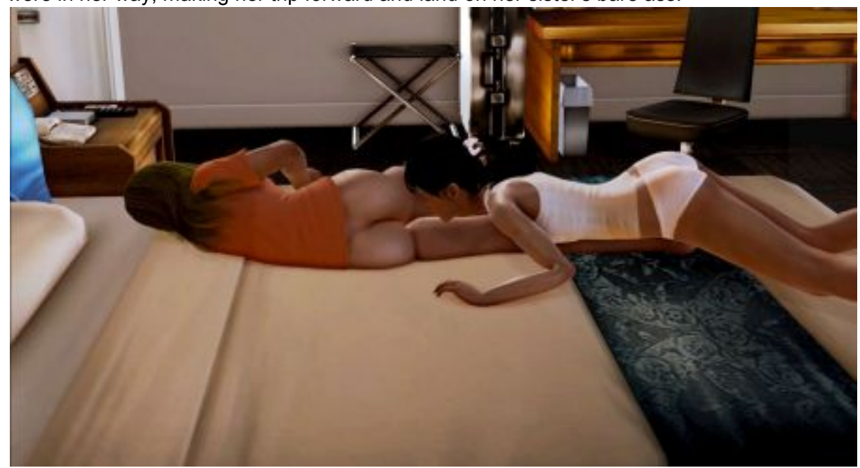
"OW, what the hell was that?" She started to get away from Lissa's ass, but something was pulling her against it.

Nia went upstairs towards her sister's room. Lissa was only wearing a shirt. Nia's belly growled. "Am I really going to eat my sister?" Grrrrlllgg. Now it was obvious what her stomach wanted "Ok, ok, I'm going." She approached slowly to her sister's bed without turning the lights on, not wanting Lissa to wake up. Unfortunately for her, her sister's shoes were in her way, making her trip forward and land on her sister's bare ass.